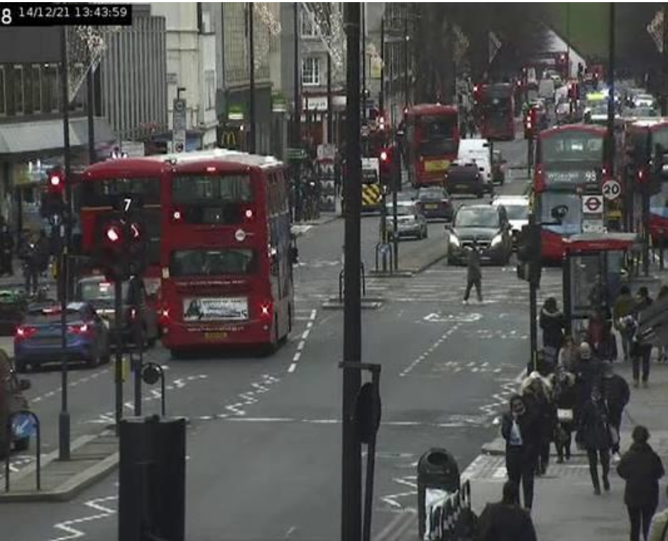
Looking southbound onto Edgware Rd / Sussex Gardens